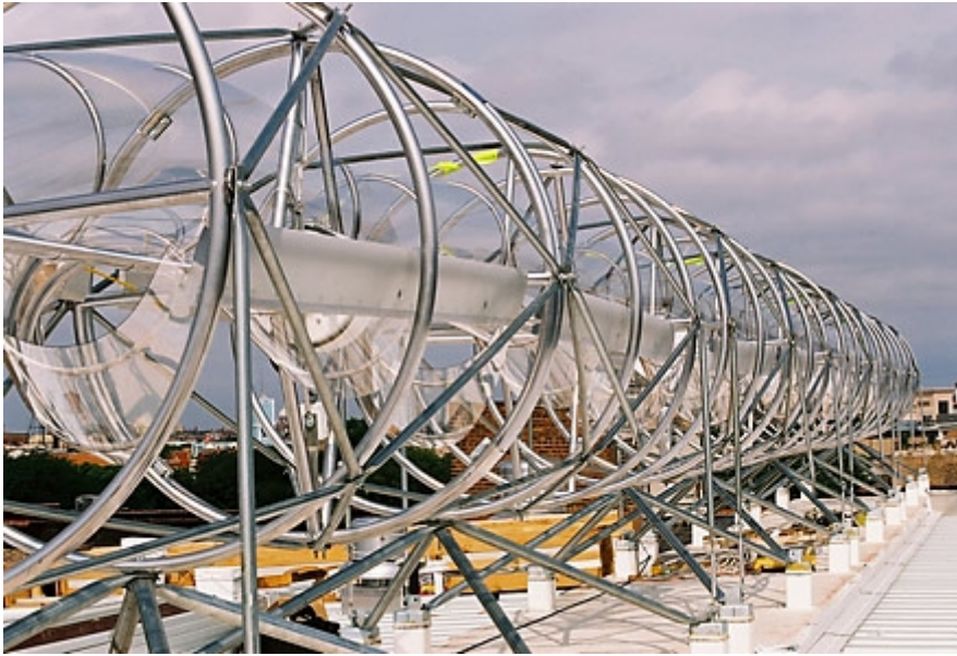
The wind turbine on top of the Near North SRO.

At the Power Engineering Society luncheon on “ Green Building Technology: Renewable Energy Sources and Design/Specification Guidelines ” at the Chicago Bar Association on December 13, over 40 attendees learned that the wind and sun are starting to become economical power sources.