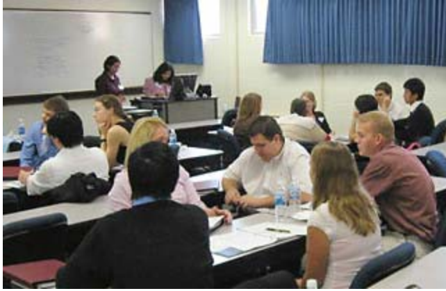
Students broke into focused small group discussions during the Student Branch Leadership workshop last year.